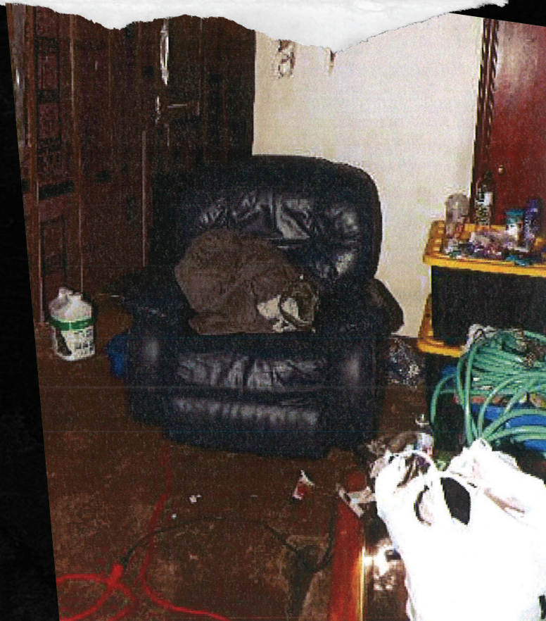
Above: the ground-level access to the home where “Shayla” was kept. Upper left and lower right: the dilapidated interior of the home.